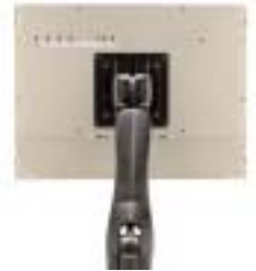
15" ChassisTouch arm mounted